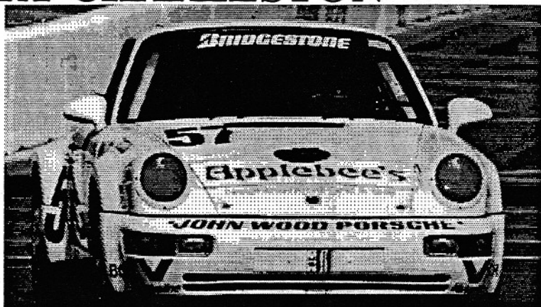
SECOND FASTEST QUALIFIER AT MIAMI FEBRUARY 1992

Phone 556-4925 1976-A Sam Rittenberg Blvd. (behind Maaco)