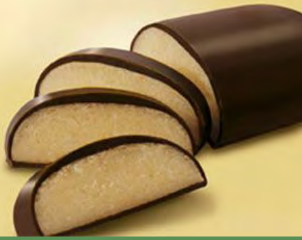
Typical chocolate covered Lübecker Marzipan