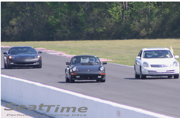
A wave by at Roebing Road during last months DE.