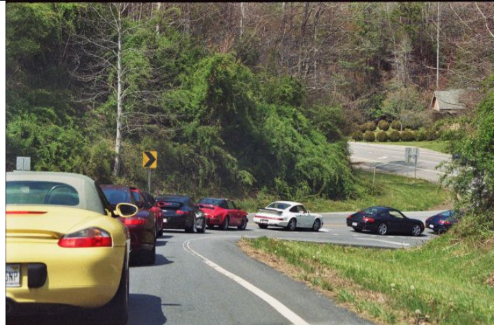
Porsches wind there way through the mountain roads headed for the Tail of the Dragon.