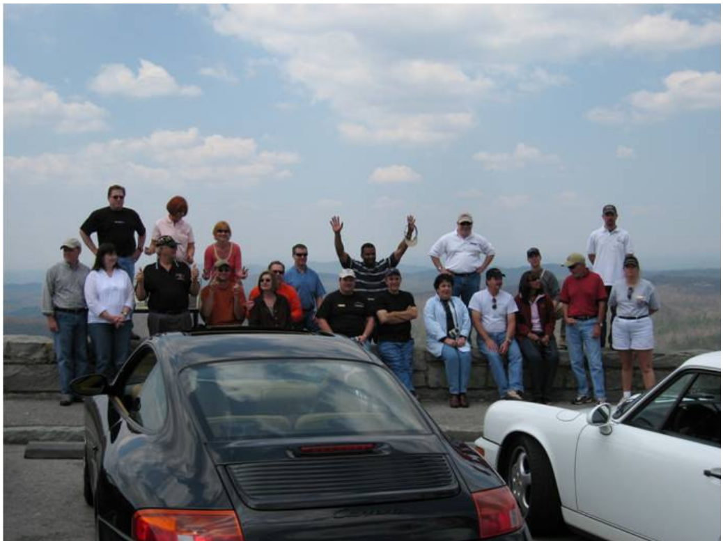
Palmetto and friends in the Mountains

Well we're back. Back at the village. Boy that was a blast. Let's go again!!! Can we? Can we? Please?