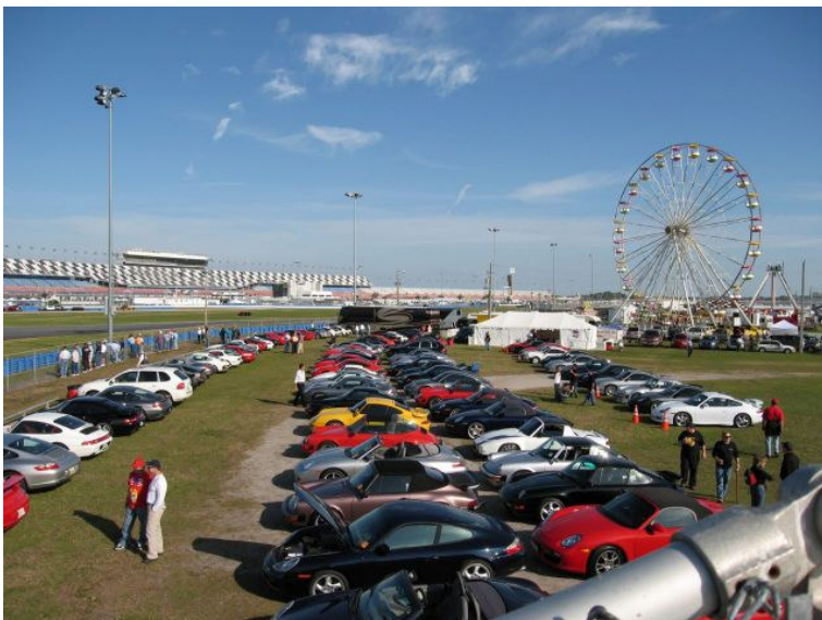
A view of the Porsche Paddock at the 24 Hours of Daytona

Mark your calendar now you won't want to miss it.