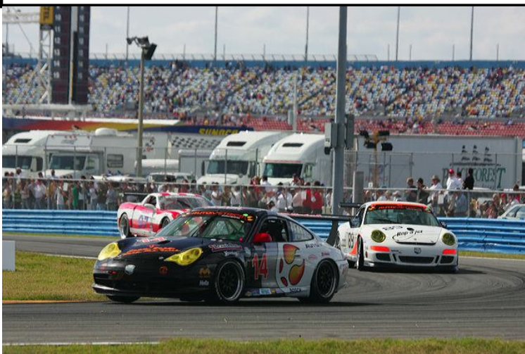
Autometrics' #14 and #89 make their way around the famed Daytona International Speedway road course during the Rolex 24 Hours.