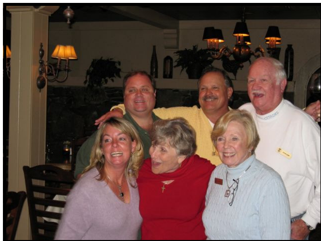
The Prez, Vice-Prez and others enjoy Fontana Village

Any questions or comments, please email any of the PCA Palmetto officers. Also, it is being discussed in our Palmetto Forum. If you are planning to attend, please let us know by posting in the forum or sending an email.